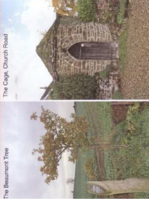
The Cage, Church Road